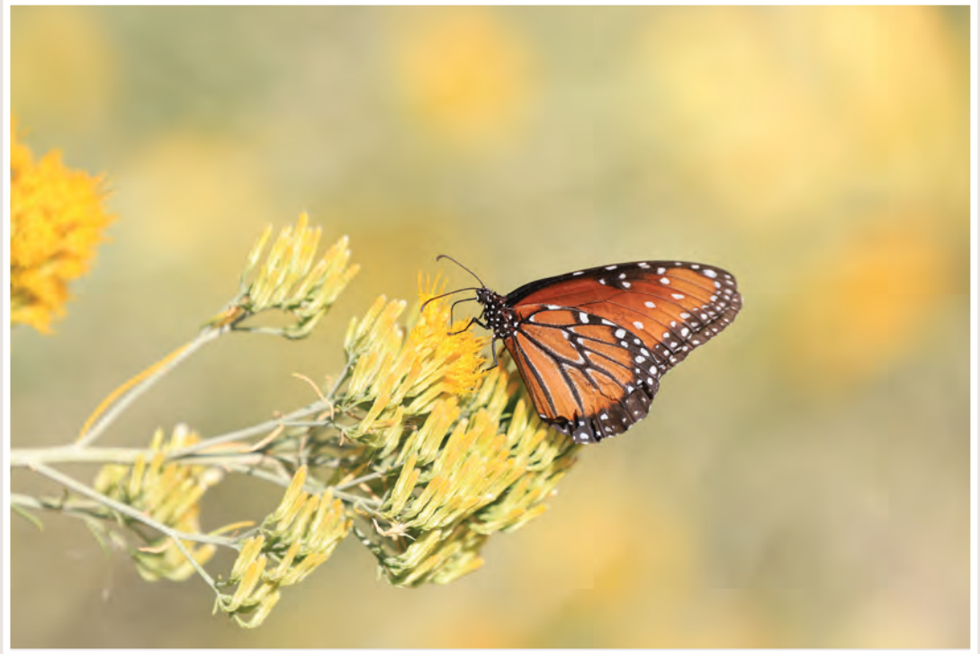
Natural Mosaic Medium: Photography Angela Hagfeldt