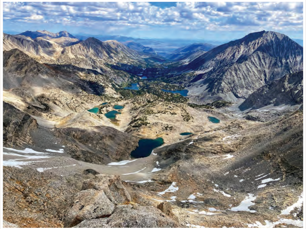
Alpine Mosaic Medium: Photography Hillary Lara